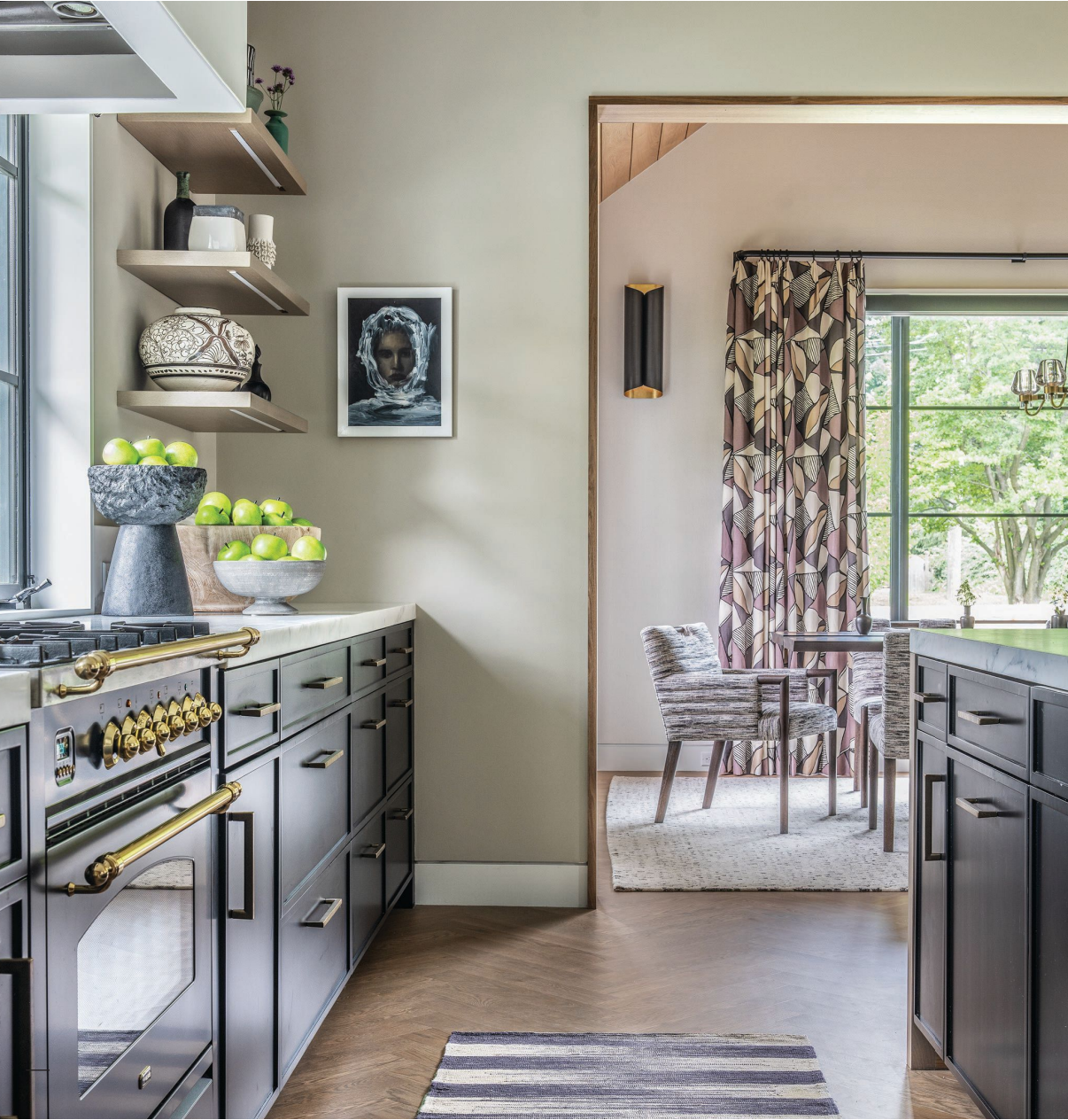
A small hallway in the home serves as the perfect corridor for coats and shoes. Opposite page: A look into the dining room from the kitchen.

in the kitchen, another previously owned painting of the client's Noodle Girl invites the family and guests to indulge in any delicacies made on the Bertazzoni (bertazzoni.com) stove. "We actually started with the stove, which is this beautiful Italian black with brass, and we so lucked out during COVID that we were able to get it," she explains. From there, Daher continued the darker hue into the custom island cabinetry—adding touches of fumed white oak—and juxtaposed