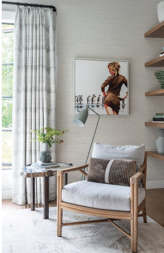
From top: Natural textures and cool grays give corners of the home, like this, a Zen-like aesthetic; geometric outdoor furniture creates the perfect patio space for entertaining. Opposite page: The dining room pops thanks to '60s-inspired curtains.