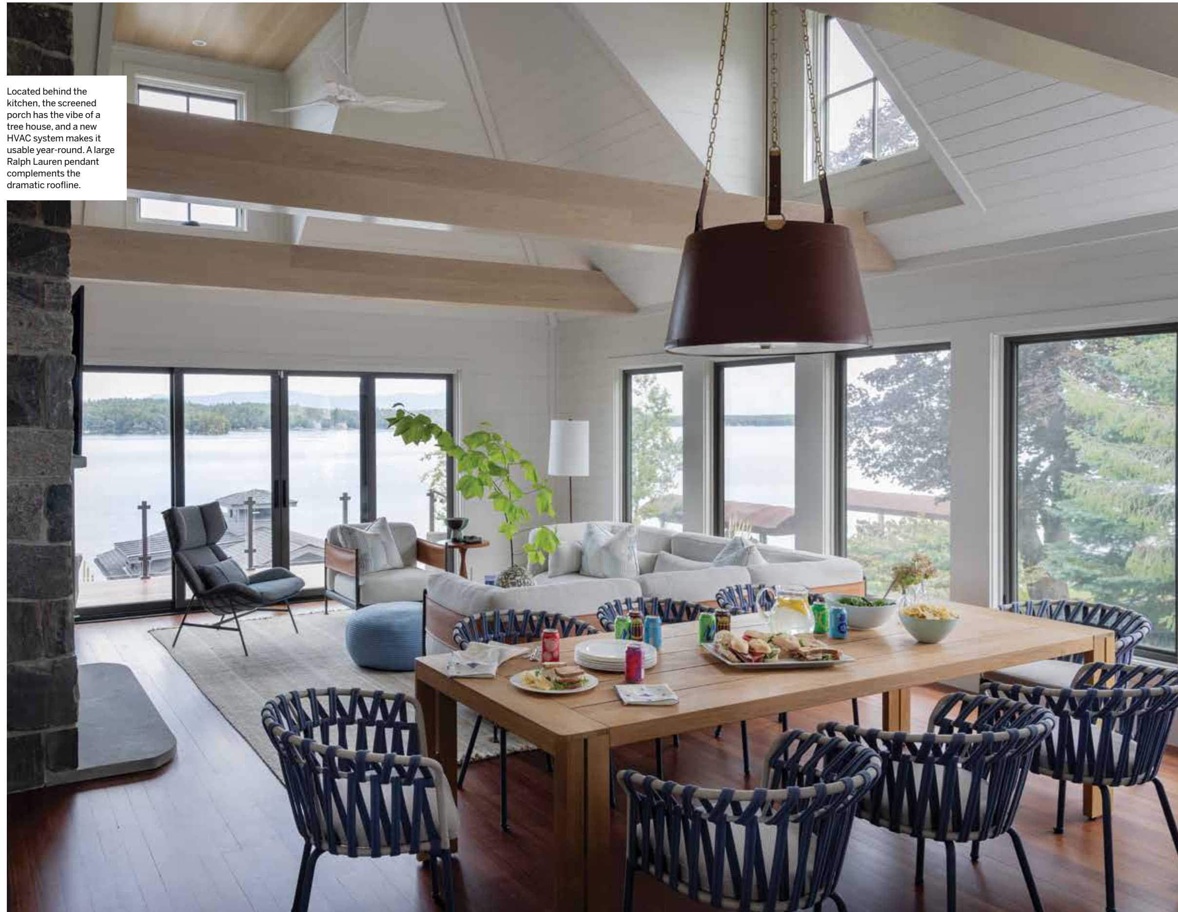
Located behind the kitchen, the screened porch has the vibe of a tree house, and a new HVAC system makes it usable year-round. A large Ralph Lauren pendant complements the dramatic roofline.