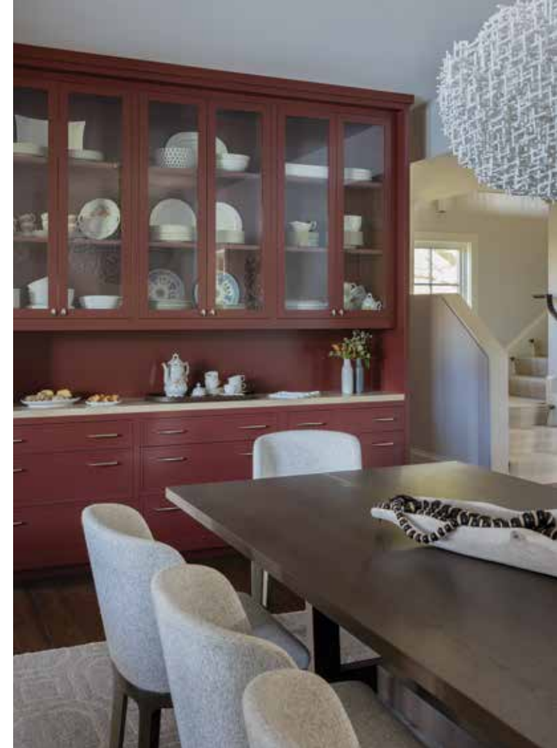
ABOVE: In the dining room, a breakfront painted Benjamin Moore Chestnut supports dinner parties and conceals a pantry with a wet bar and flower-arranging counter. LEFT: The primary suite, located on the main level, is accessed through this hallway, wrapped in a watery hued banana-tree-bark wallcovering crafted in Belgium by Omexco. FACING PAGE: In the kitchen, also part of the great room, Hector Finch pendants illuminate dual islands and reflect off the glossy zellige-tile backsplash. New Hampshire’s JH Klein Wassink crafted the cabinetry.

Built-ins and secret nooks abound, like in the youngest daughter’s suite where her study boasts cubbies and shelves for art supplies and books. A hidden door in a wall of shelves in the lounge opens to reveal a billiards room. In a guest suite, millwork conceals a desk, chests of drawers, and shelving.