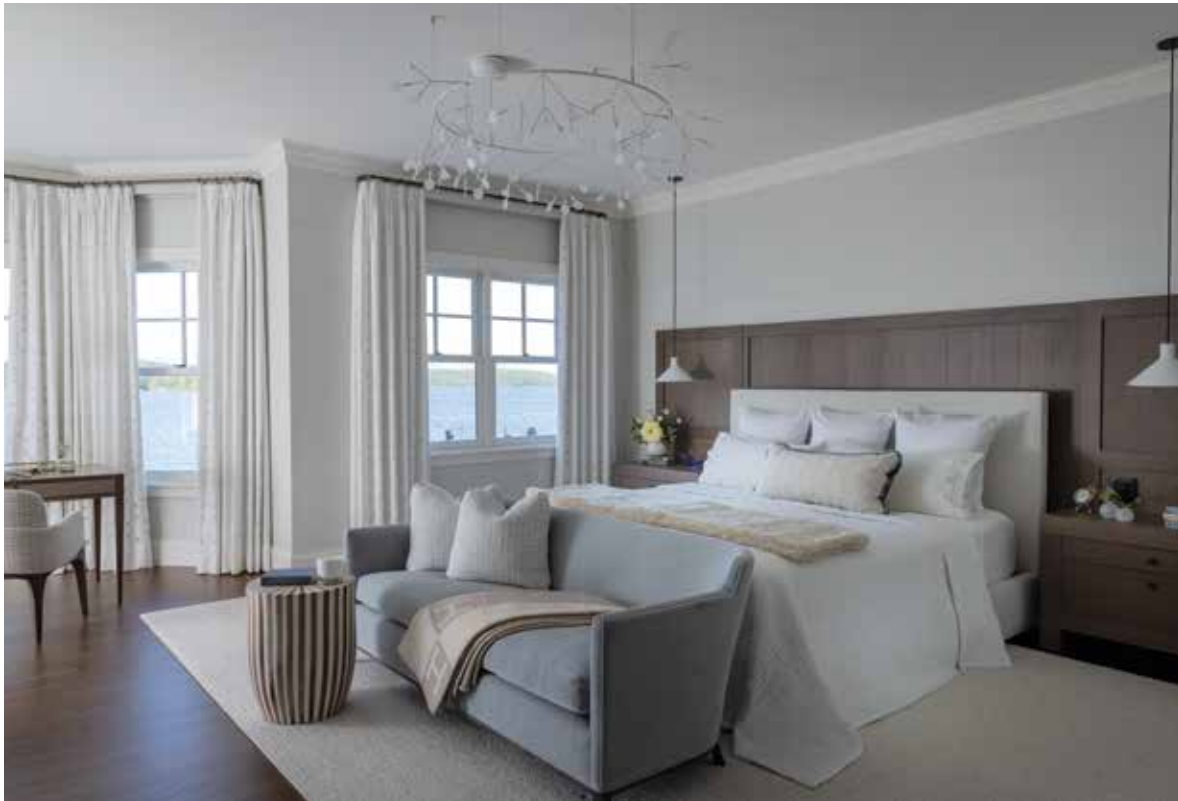
CLOCKWISE FROM ABOVE: To add layers and coziness to the large primary suite, the Dahers designed a walnut headboard that spans almost the entire length of the wall. The youngest daughter's study features built-in storage for her hobbies, while a new dormer hugs her workspace. A wall of shelves in the garden-level lounge masks the door into the billiards room. FACING PAGE: The Dahers decorated the eldest daughter's room in shades of lavender and purple; the painting was a gift from her parents.