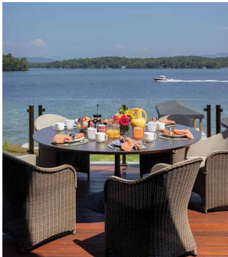
ABOVE: Breakfast on the kitchen deck comes with views of the boathouse, covered dock, and, of course, the lake. The chairs are from Kingsley Bate. RIGHT: Meridian Construction replaced the existing dock's pressure-treated boards with ipe decking and trim. Just out of frame is a new sandy "perch beach."

“None of the rooms took a back seat,” says Clayton. Not even the primary suite hallway, with its 100-year-old antique rug from Afghanistan and banana-tree-bark wallcovering.